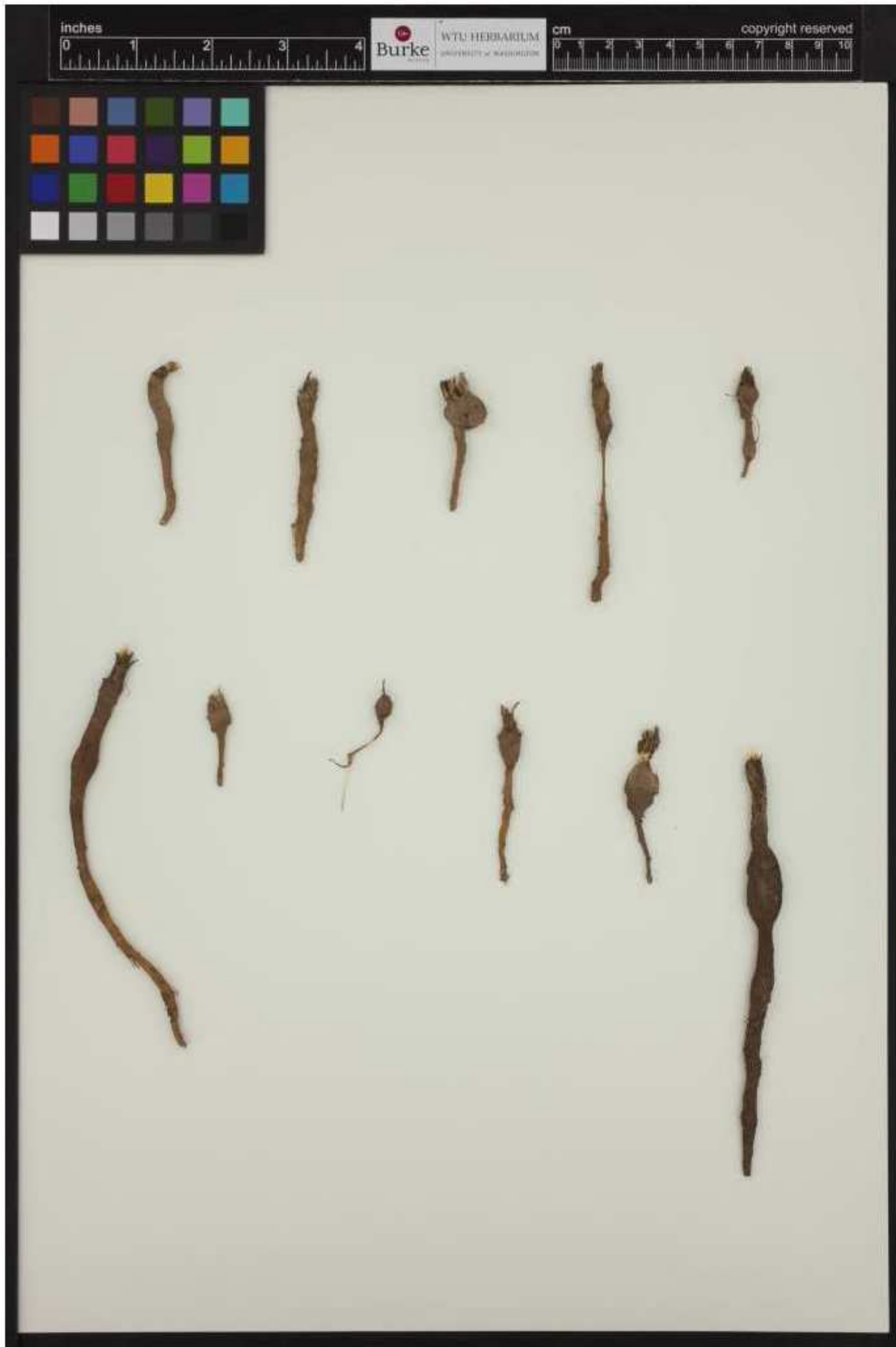
Figure 4. Lomatium knokei roots depicting the range of variation of morphology typical for the species. Note the tuberos swelling immediately beneath the root crown on the majority of the specimens.